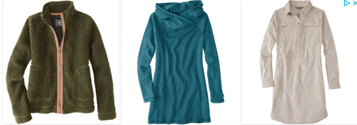
title nine Title Nine® Official Site