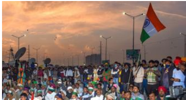
SC to examine if protests against farm laws can go on