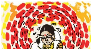
Dowry deaths account for 40% to 50% of female homicides

"Dowry is the main reason for female foeticide. These are not two separate problems. They are interlinked," Satya Naresh tells A Ganesh Nadar/Rediff.com .