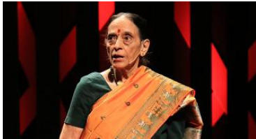
'Demand inheritance, not dowry'