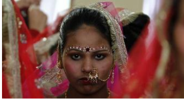
Why we don't read about dowry deaths any more

Kindly note the image has only been published for representational purposes.