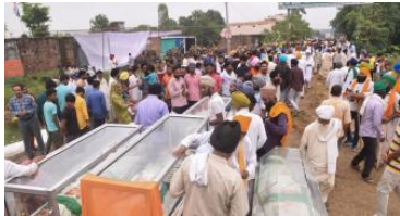
Lakhimpur: Murder case against Union minister's son