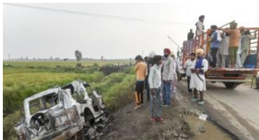
Lakhimpur: Central forces deployed; Internet shut