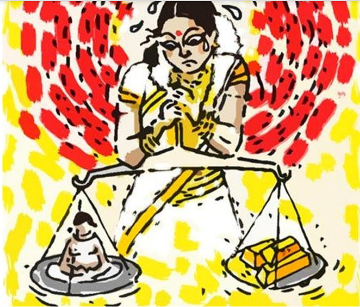
Illustration: Dominic Xavier/Rediff.com

*One the main reason behind the dowry system, Naresh says, is the belief among many that it is an honour to receive dowry; they also feel it is their responsibility to give a dowry to their girl child.